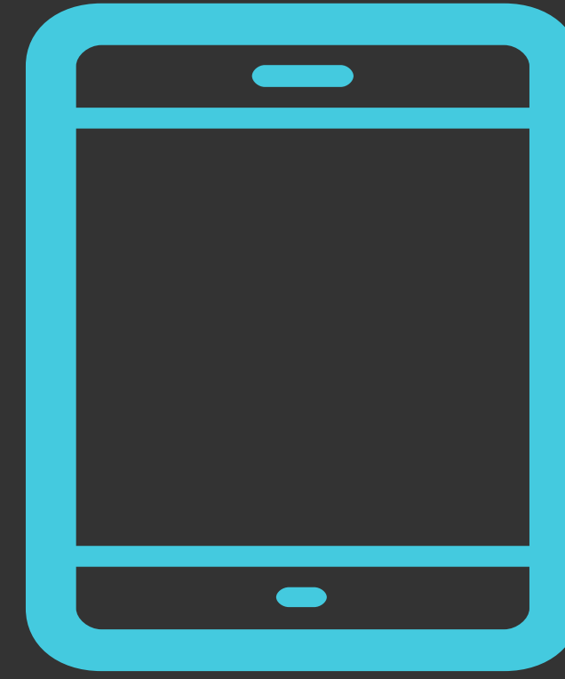
Semiconductor and Consumer Industry