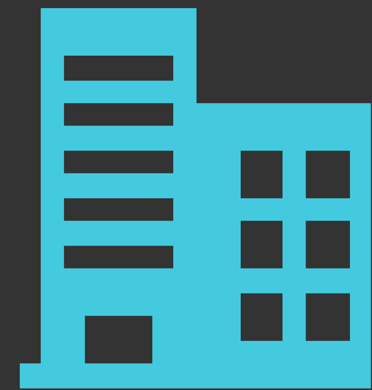
Smart City and Mobility